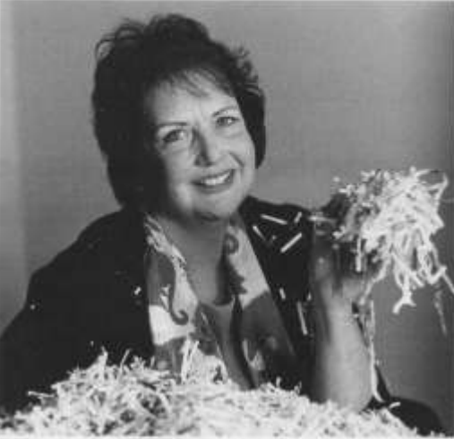
PAPER JAM: I still have the warranty and the receipt from the last 23-inch color television we bought. I just don't have the TV.

and process all of it? Are we simply in love with information for information's sake? If you've ever spent half a day in your pajamas while you fill out your tax return, as I did a few months ago, you can't help noticing that this tsunami of stuff keeps getting in the way. It glazes the eyes. It numbs the brain.